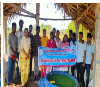
III BSc (MBC)