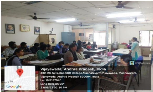
III BSC (MBC)