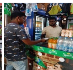
I and II BSc (MBC & MBFT)