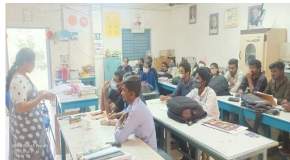
III BSc (MBC)